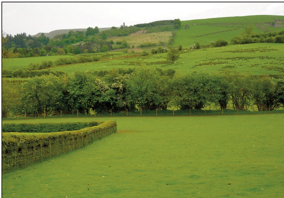
Pastures outside of Llangurig, Wales. Would that readers could see the verdant green. Remember, online viewers can, indeed, see the green.

Photo taken at the Mid Wales Arts Centre, outside Caresws in mid-Wales.