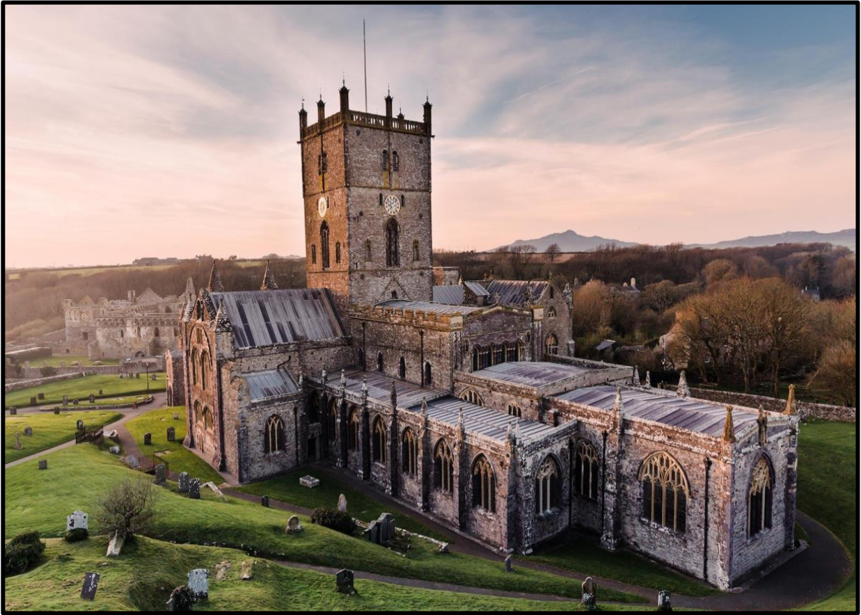
St. David's Cathedral [ Eglwys Gadeiriol Tyddewi ] is an Anglican church in St. David's, Britain's smallest cathedral city. In 1123, Pope Calixtus II bestowed a papal privilege upon St David's, making it a center of pilgrimage for the Western world; the Pope decreed that "Two pilgrimages to St David's is equal to one to Rome, and three pilgrimages equal to one to Jerusalem."