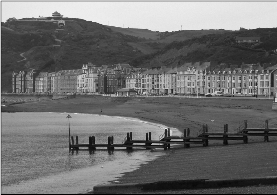
Pier at Aberystwyth, Ceredigion, Wales