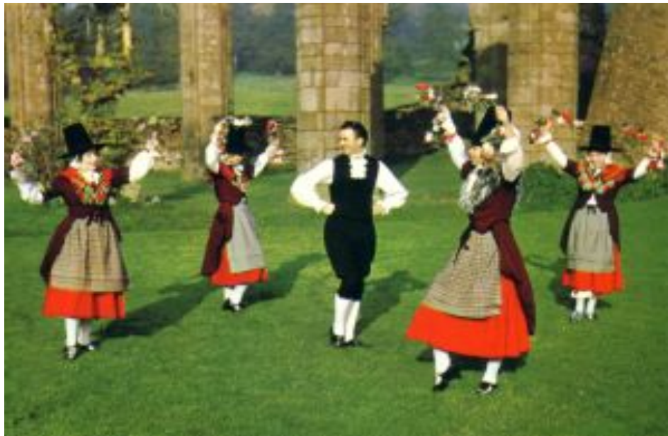
Postcard of a Welsh dance team practicing at Strata Florida, near Llangollen.

We gave this workshop at last year's NAFOW in Lincoln, Nebraska and we are excited to be asked to do it again this year. Won't you please join us in the dance? We certainly hope so!