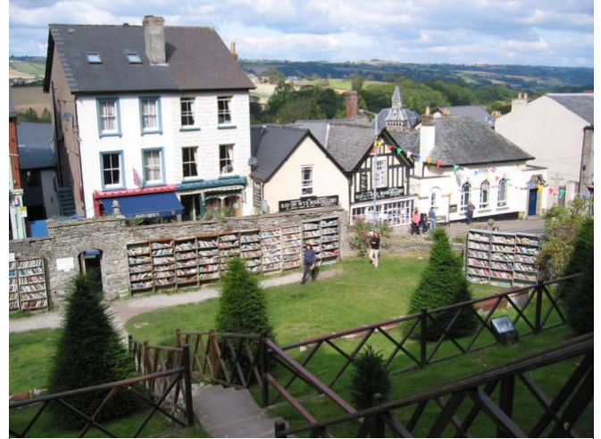
Hay on Wye