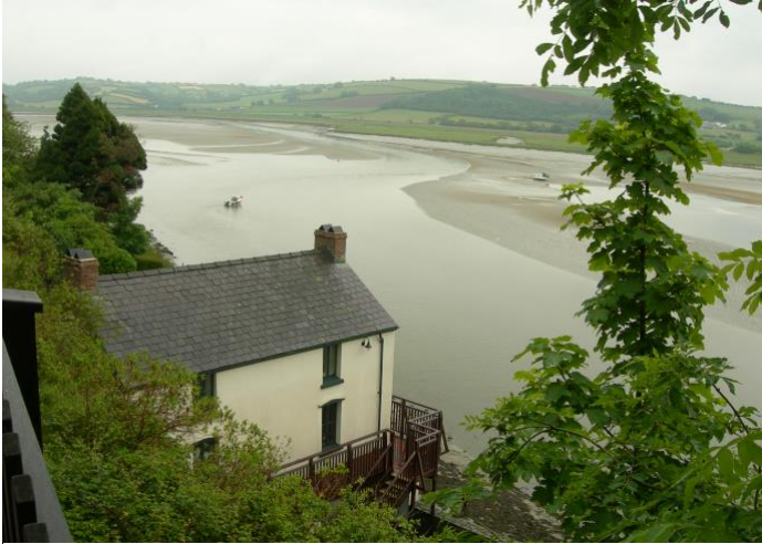
Dylan Thomas' House