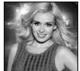
Katherine Jenkins, world-famous Welsh soprano.

When she was 23, Katherine signed what was said to be the biggest ever UK classical recording deal; she has broken records becoming the fastest selling mezzo soprano ever, has released eight studio albums, has won two Classical BRIT