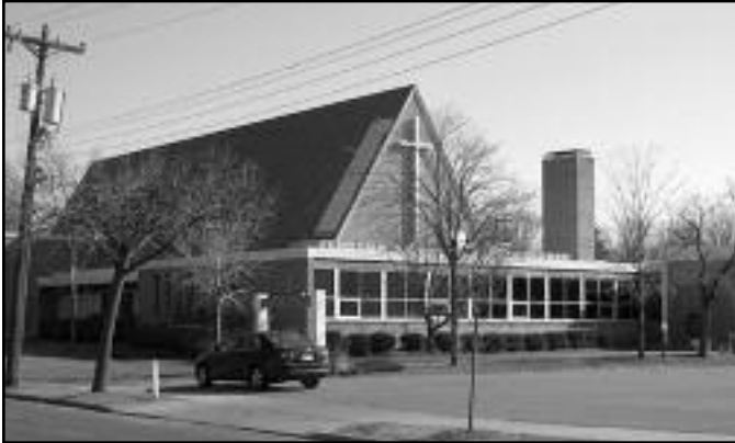
The Spring Gymanfa Ganu will be held Sunday, April 29, at 2 p.m., at Lake Harriet United Methodist Church.