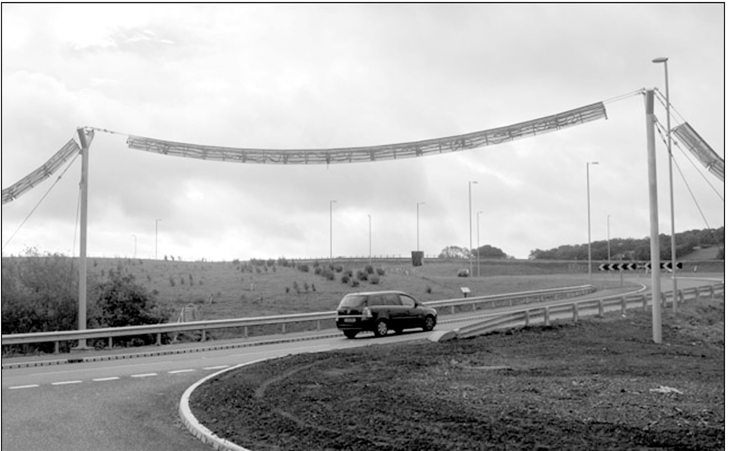
The dormouse bridge near Llantrisant, South Wales, cost £190,000

But Welsh voters might wish to argue that such a bridge isn't the wisest use of tax dollars. A dormouse bridge near Llantrisant, South Wales, has been constructed by the Rhondda Borough Council at a cost of £190,000 ($313,158).