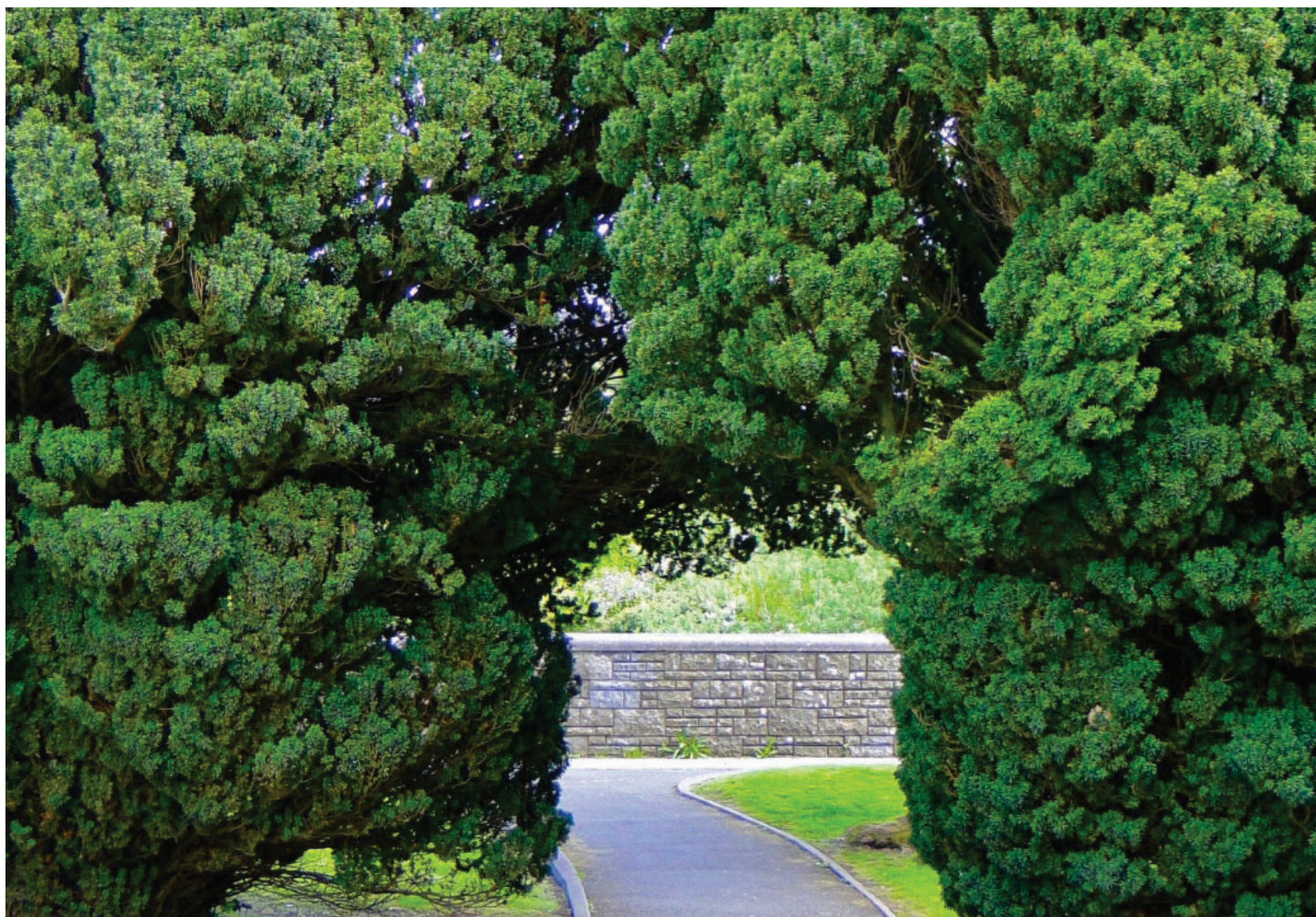
Park in Newtown, Wales

August 4 — Choice of poetry by any Welsh poet.